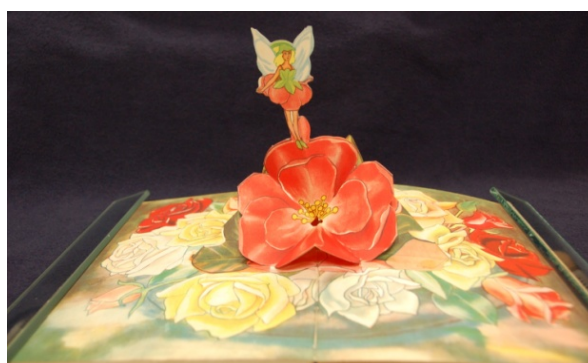
Bookano Stories with Pictures that Spring up in Model Form. No.10 , Edited & Produced by S.Louis Giraud, London: Strand Publications, 1943.